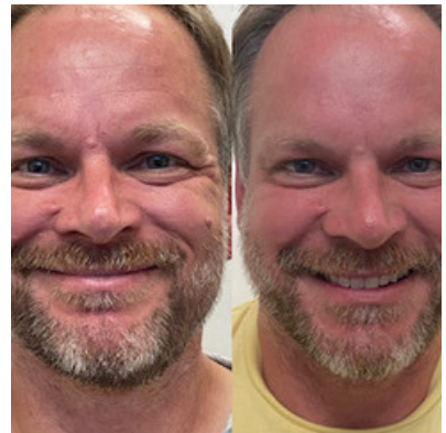
Botox treatment areas: Forehead, Crows Feet (around the eyes), and Gabella (between the eyes)