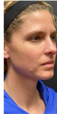
Midface and Lip Enhancement