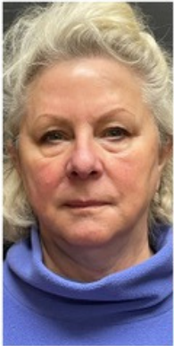
Midface Enhancement, Chin and Jaw Definition